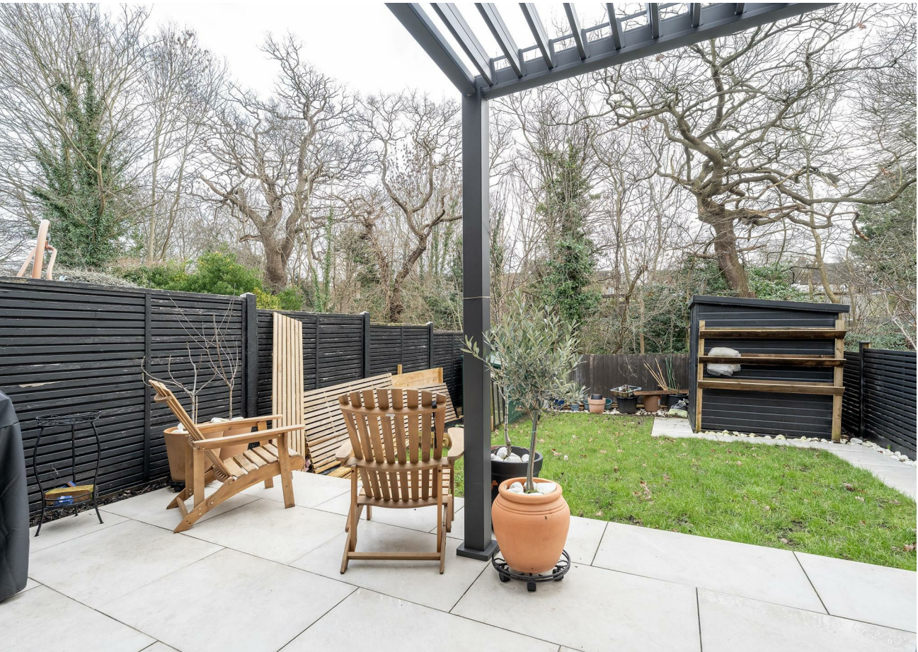
Garden 20'11" x 38'4"